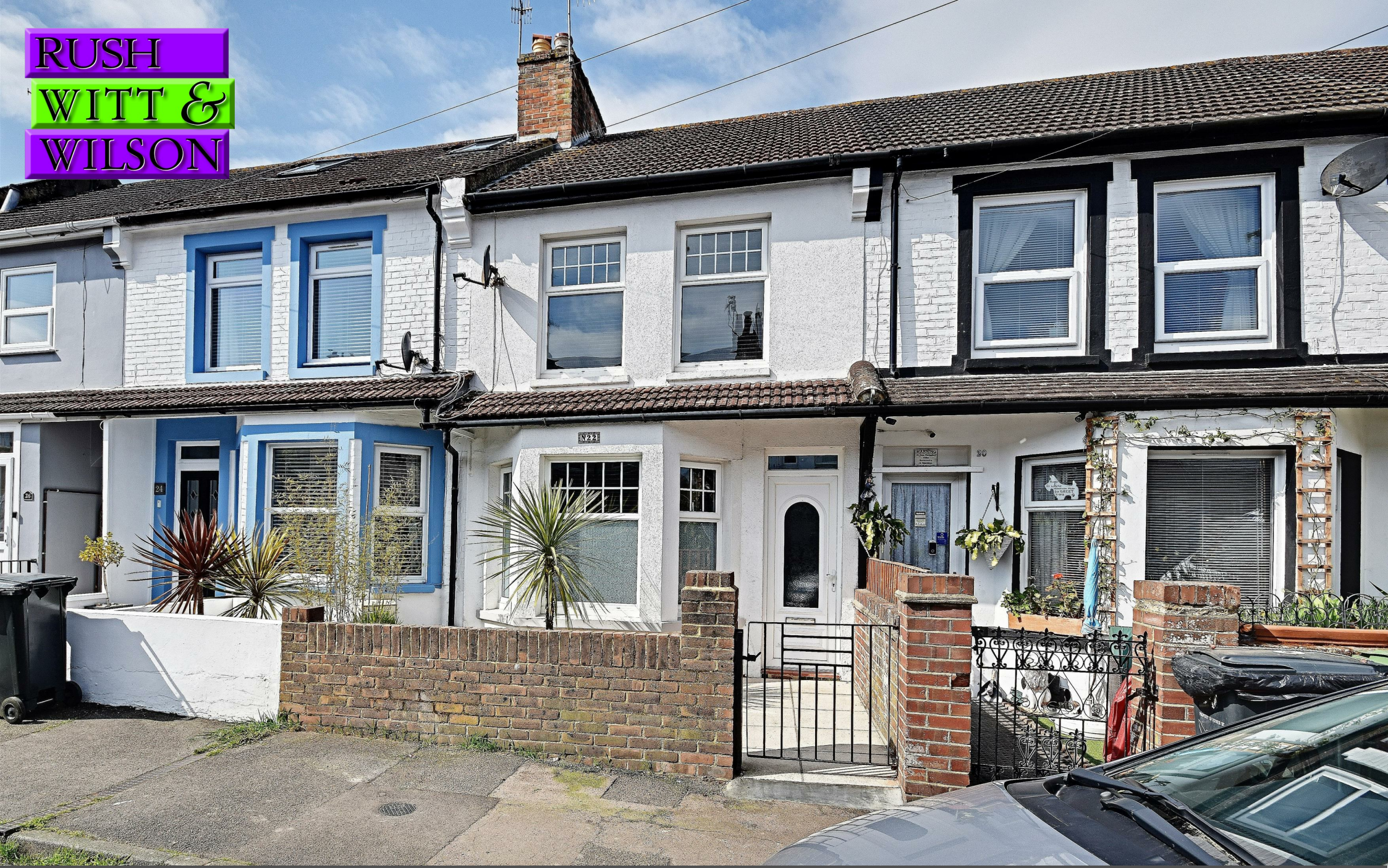
22 Chandler Road, Bexhill-On-Sea, East Sussex TN39 3QN £275,000